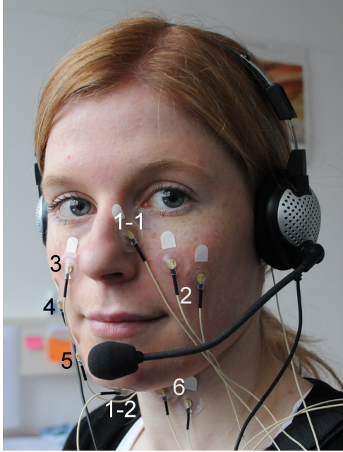
Figure 1: EMG-UKA electrodes with bipolar derivation (white) and derivation against a neutral reference (black numbers).